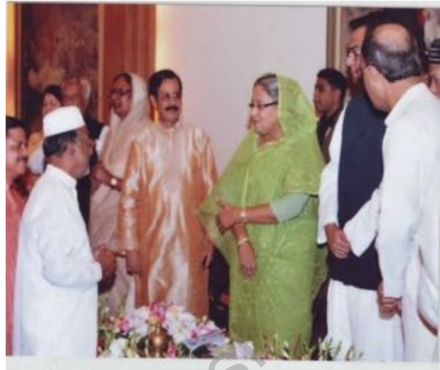
Pic: Exchanging pleasantries with the Hon. Prime Minister of Bangladesh, Sheikh Hasina