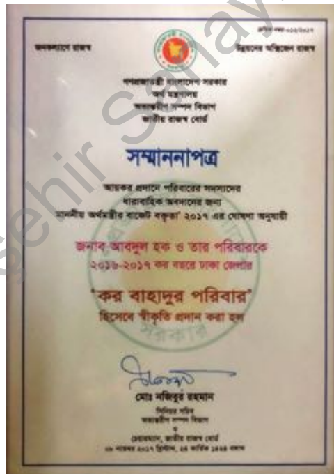
Pic: “কর বাহাদুর পরিবার” recognition from the Govt. of Bangladesh