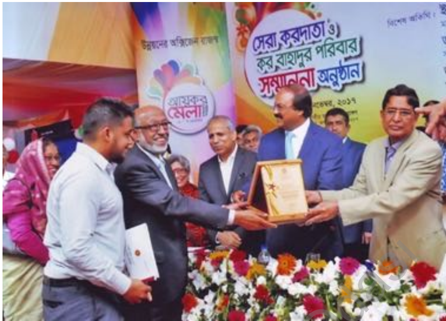
Pic: Receiving recognition from the Govt. of Bangladesh for “কর বাহাদুর পরিবার”