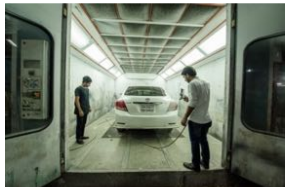
Paint work ongoing in fully equipped paint booth

No single automotive trader in Bangladesh has such comprehensive workshop and support engineering facilities at one place, which will cater all the technical needs of the customers. This facility is now being considered to be expanded and optimally used for other commercial/Industrial operations, like reconditioning of automotive vehicles, using the bonded house concept. Haq's Bay is also