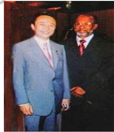
Pic: With former Hon. Prime Minister of Japan, Mr. Shinzō Abe (Left) and his successor, Hon Prime Minister of Japan, Mr. Tarō Asō, during their respective visits in Bangladesh as a leading dignitary representing Japan Bangladesh Chamber of Commerce and Industry (JBCCI).